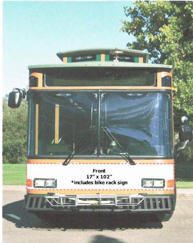
Front 17" x 102" *includes bike rack sign